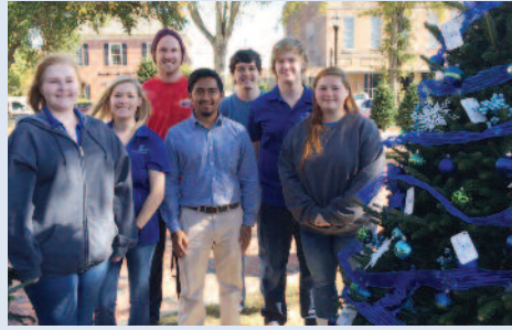
Scholars decorate tree donated by Jasper Decorating Center for the Festival of Lights in December 2016.

In Spring 2017, scholars volunteered to help with the Rotary Club of Jasper's Trivia Night fundraiser and 78 Magazine's Third Thursday at Bank of Walker County. On their own, many scholars gave their time to church groups, animal shelters, food banks, health organizations, and a variety of other non-profit organizations.