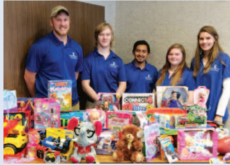
Scholars donate toys to Capstone Rural Health Center in December 2016.